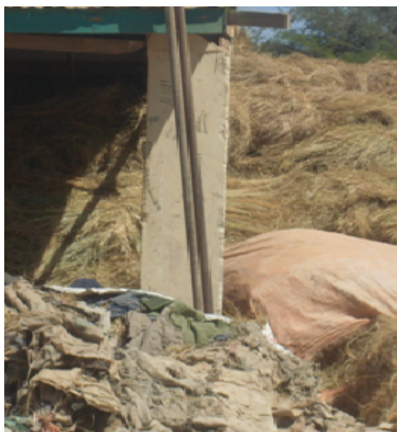
Pic 1: Fodder in Hargeisa Livestock Market

price by selling crops for livestock feed than waiting for the crops to mature. Second, long before the ban of the fodder trade, border grazing sites were privatized and hired out to livestock traders trekking livestock along the border. The price of hired grazing increased after the fodder ban.